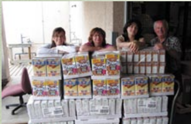
Loyalist College Receiving Granola Bars For Snack Sites

The QRFSS was founded in 2001 as a coalition of 9 food banks which are located in Belleville, Brighton, Deseronto, Madoc, Marmora, Picton, Quinte West, Stirling and Loyalist College, with occasional assistance to Campbellford, Cobourg and Port Hope.