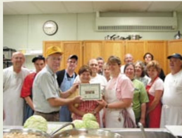
Living Hope Meals Program